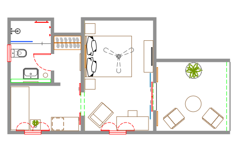
*2 layouts available for the Comfort Family rooms