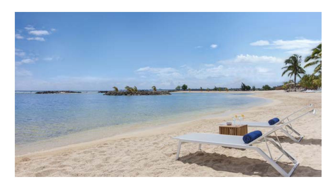
Veranda Pointe aux Biches * * * *

A peaceful haven at the very heart of a tropical garden, overlooking the Indian Ocean, where the guests are invited to remove their shoes to feel the sand underneath their feet, and be instantly anchored to the earth.